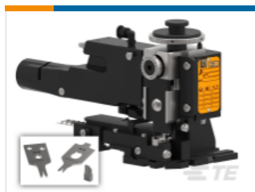
TE Part # 7-2837445-2 OCEAN_2.0_Applicator-S-042F062OA