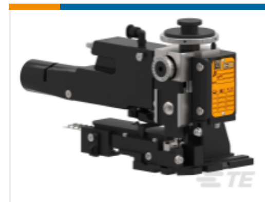
TE Part # 2837445-2 OCEAN_2.0_Applicator-S-042F062OA