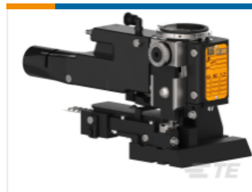
TE Part # 2-2837445-2 OCEAN_2.0_Applicator-S-042F062OA